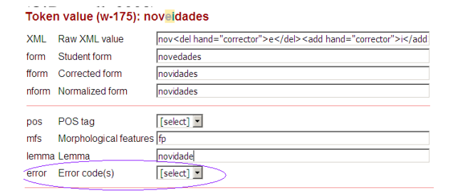
Figure 2: Error annotation scheme at the token level (in preparation)

The next step will be to label the data following a typological scheme for error annotation (Tono, 2003; Nicholls, 2003; Dagneaux et al., 2005). Error annotation will be done at two level: word-internal errors such as orthographic errors; morphological errors and lexical errors will be modelled over the token, by adding the error code in the same fashion as the POS and lemma, as shown in Figure 2. Segment based errors, such as word order errors, agreement errors, errors to idiomatic expressions, etc., will be modelled in a stand-off fashion using a module of TEITOK specifically built for this purpose, where error codes are related to sequences of tokens, in a way similar to for instance the UAM Corpus Tool