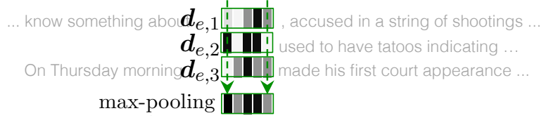
Figure 3: Max-pooling takes the max value of each dimension of dynamic entity representations, modeling accumulation of context information. It is then fed to x_{c,\tau} as input to LSTMs.