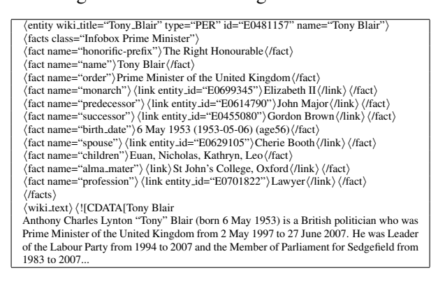
Figure 2: Excerpt from the KB entry for Tony Blair (E0481157). From LDC2009E58.