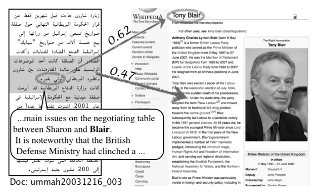
Figure 1: Linking an Arabic query referring to Tony Blair to a Wikipedia-derived KB using name matching and context matching features.